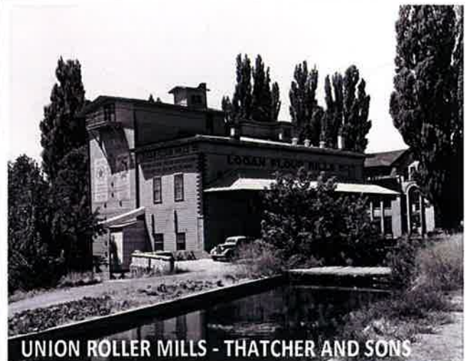
UNION ROLLER MILLS - THATCHER AND SONS