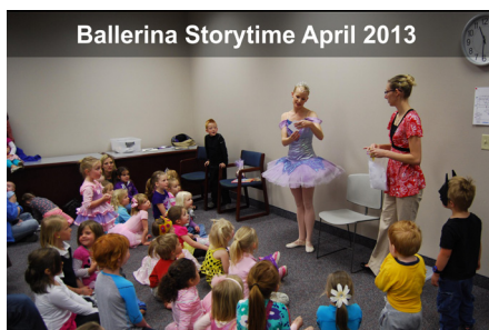
Ballerina Story Time