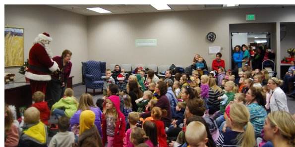
Santa Story Time