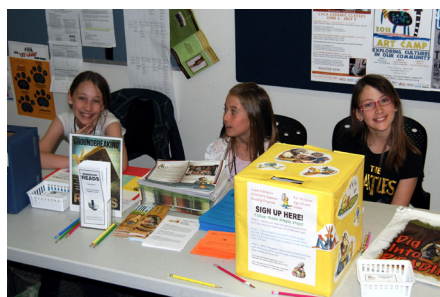
Summer Reading Program Sign Up